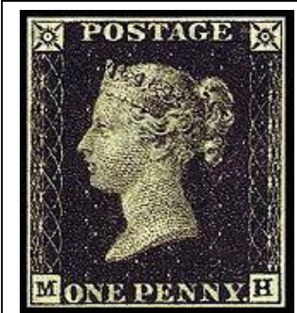
The Penny Black - the world's first adhesive postage stamp, introduced in 1840

Rowland Hill was born in Blackwell Street, Kidderminster, in 1795, an event commemorated by a stone laid in the building which now occupies the site.