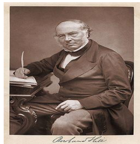
Portrait of Sir Rowland Hill

Two years after his death a statue was erected outside Kidderminster Town Hall to honour his work.