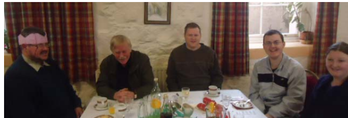
The Gang's All Here