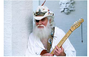
Dr Hook featuring Ray Sawyer